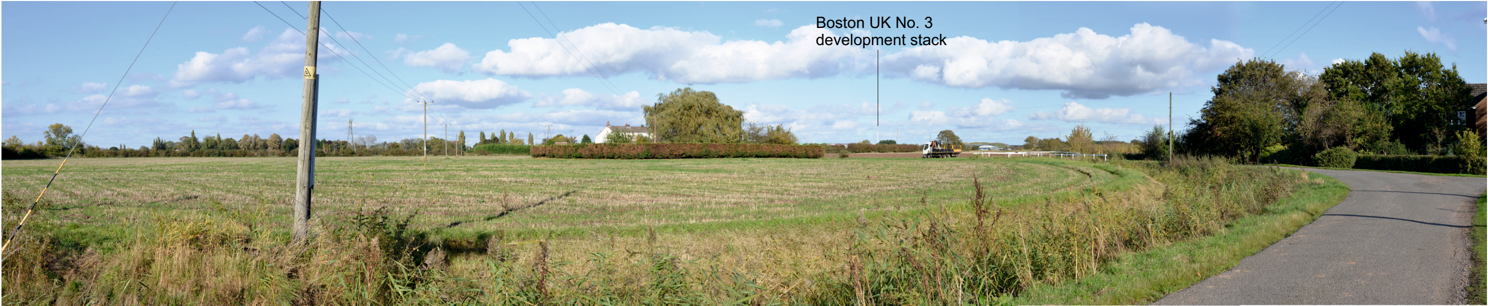
View 14: Looking north east from Church Lane at Wyberton Park near property Denemere (E533122, N340821, 3mAOD, 34 degrees, 1.2km from site boundary)