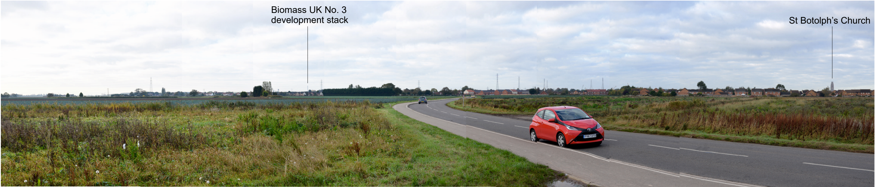
View 1: Looking south west from Toot Lane near Hawthorn Tree Primary School (E534991, N343686, 3mAOD, 212 degrees, 1.5km from site boundary)