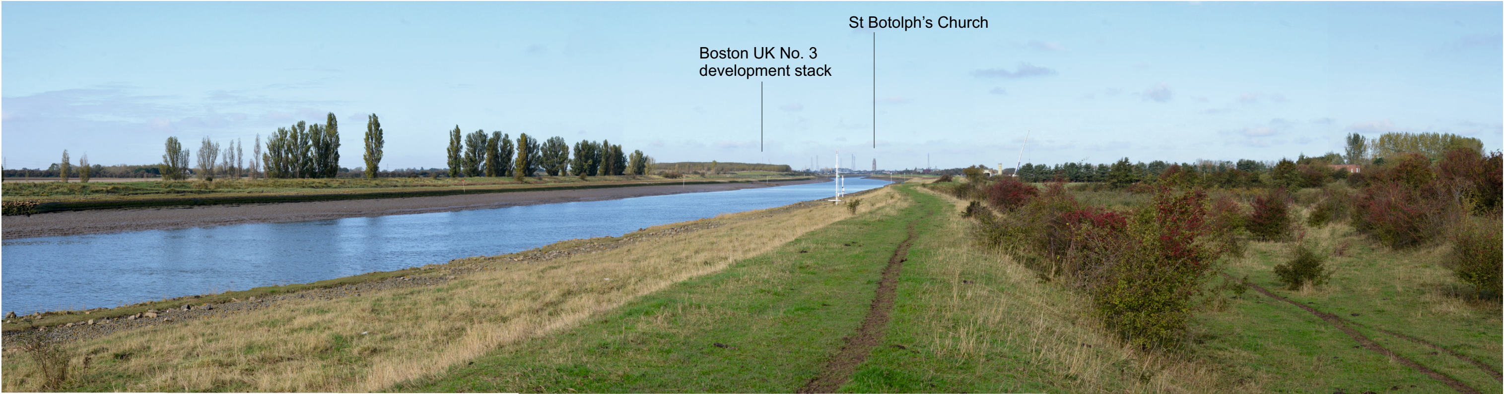
View 6: Looking north west from Footpath Fish/13/10 at junction with Footpath Fish/13/9 on the north bank of The Haven (E535841, N340453, 6mAOD, 310 degrees, 2.2km from site boundary)