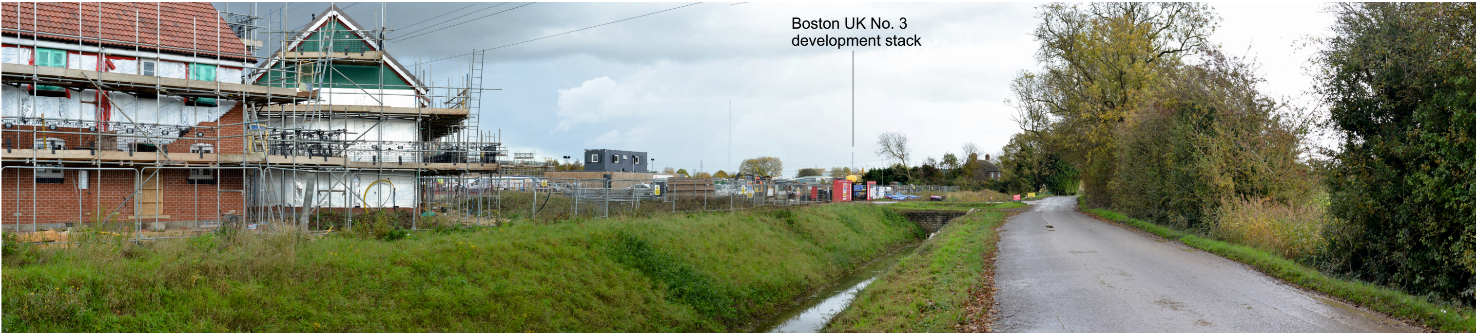
View 11: Looking east from Slippery Gowt Lane alongside properties off Wyberton Low Road (near Sustrans Route 1 / North Sea Cycle Route) (E533230, N341638, 5mAOD, 57 degrees, 750m from site boundary)