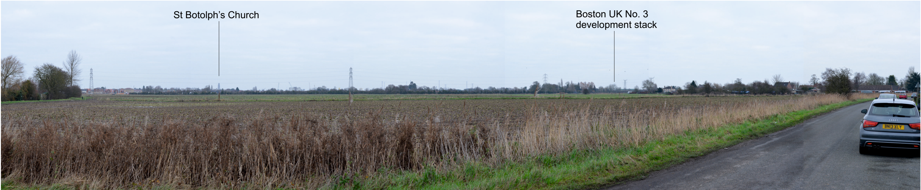
View 16: Looking north east from properties off Causeway (E532419, N340990, 3mAOD, 55 degrees, 1.6km from site boundary)