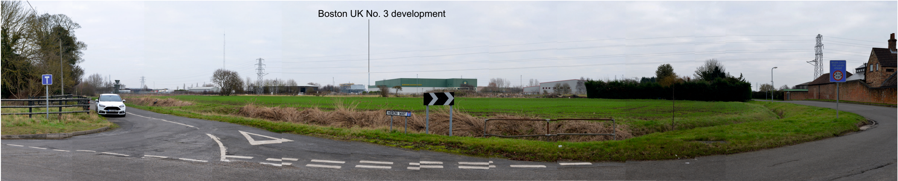
View 12: Looking north east from junction of Crosshill Lane and Slippery Gowt Lane (E533435, N341642, 3mAOD, 72 degrees, 445m from site boundary)