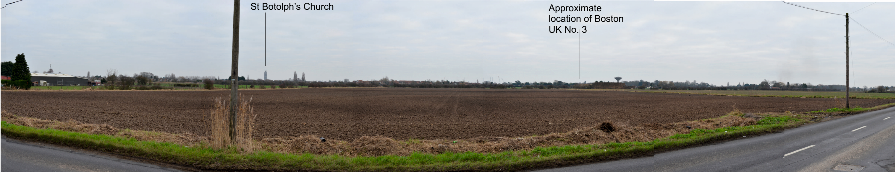
View 18: Looking east from properties along West End Road, Chain Bridge (E530727, N342852, 3mAOD, 104 , 2.9km from site boundary)