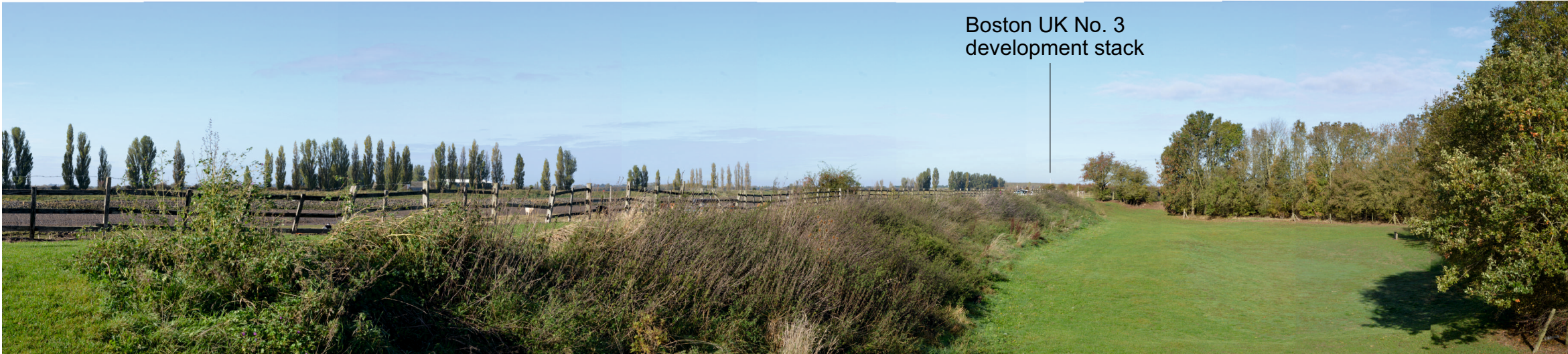
View 5: Looking north west from the Pilgrim Fathers Memorial to the north of The Haven (E536082, N340195, 6mAOD, 311 degrees, 2.5km from site boundary)