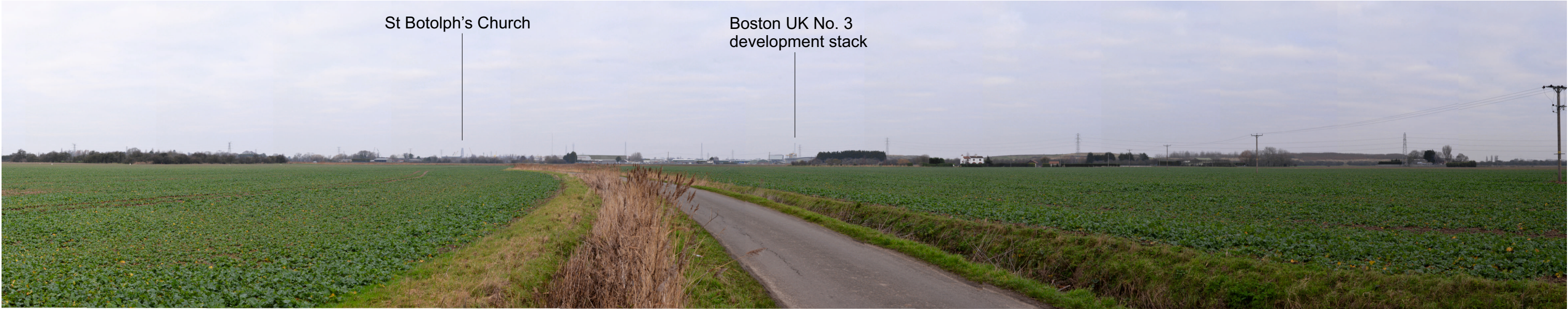
View 15: Looking north from near properties off Rowdyke Road (E533926, N340695, 3mAOD, 01 degree, 1.1km from site boundary)