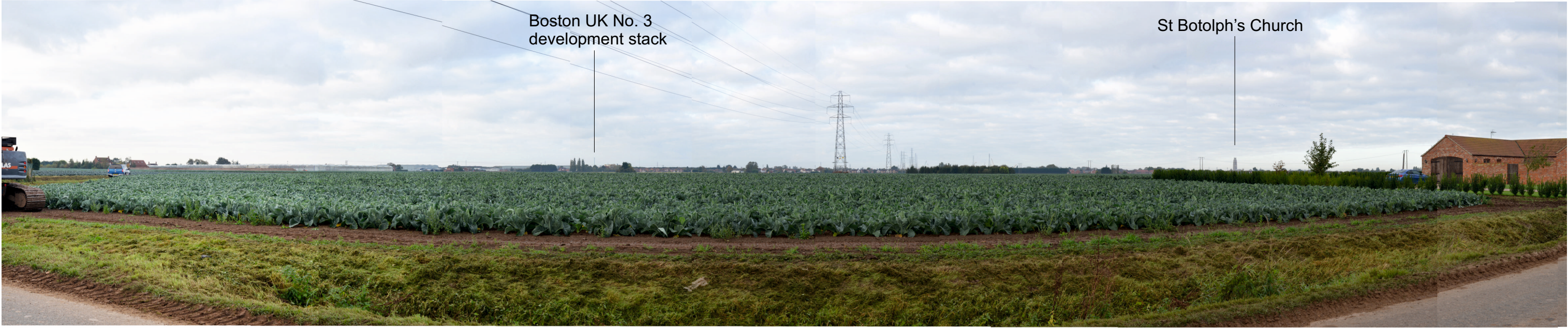
View 2: Looking south west from Church Green Road near Fishtoft (E535814, N343277, 2mAOD, 237 degrees, 1.8km from site boundary)