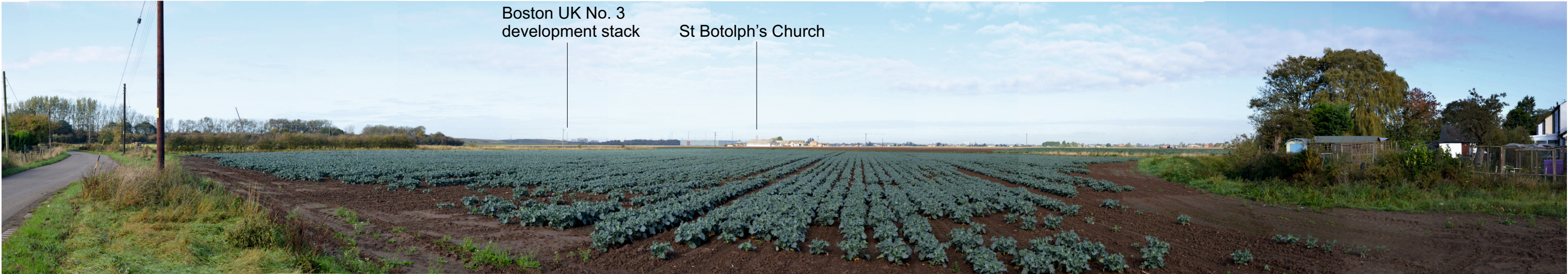
View 4: Looking north west from Scalp Road, near property Appleside (E536066, N341271, 3mAOD, 290 degrees, 2km from site boundary)