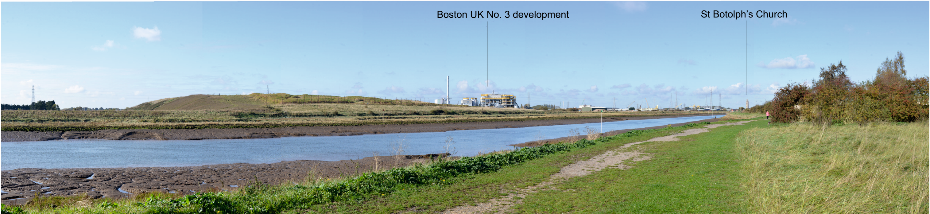
View 7: Looking north west from the junction of Footpaths Fish/13/2, Fish/13/5 and Fish/13/7 on the north bank of The Haven (E534628, N341961, 6mAOD, 278 degrees, 500m from site boundary)