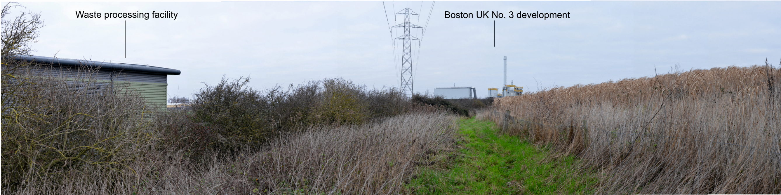
View 9: Looking north from Footpath Bost/14/8 (E534135 N341740, 6mAOD, 327 degrees, 67m from site boundary)