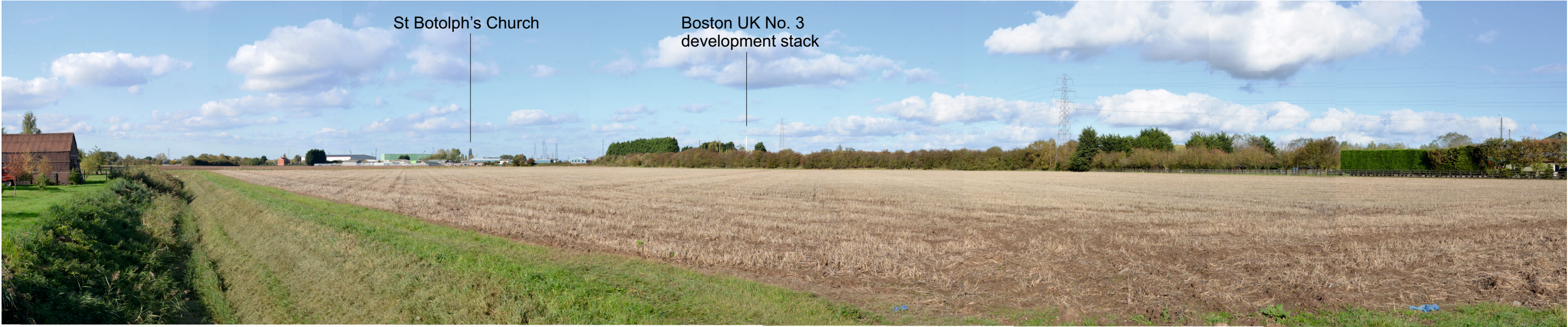
View 13: Looking north from Silt Pit Lane near property Silt Pit Farm (E534190, N341034, 3mAOD, 347 degrees, 780m from site boundary)