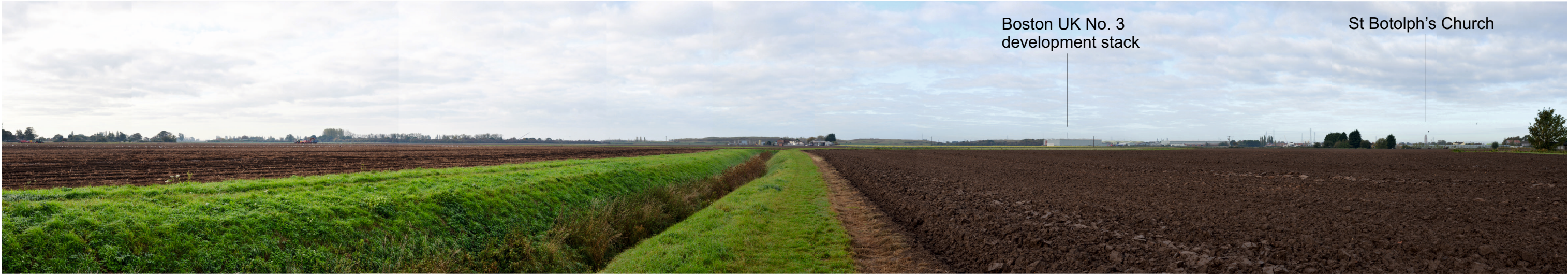
View 3: Looking west from Footpath (Fish/3/1) at Fishtoft (E536054, N342215, 3mAOD, 266 degrees, 1.8km from site boundary)