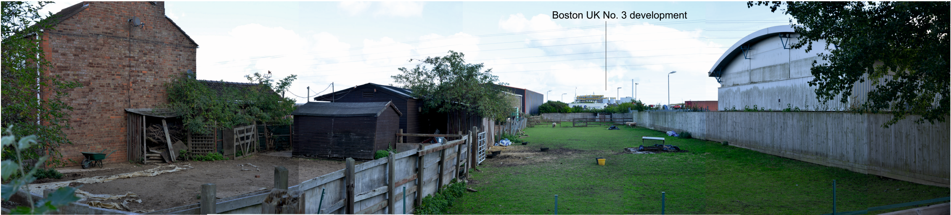
View 10: Looking east from Marsh Lane near property Cremorne and opposite property Coronation Villa (E533523, N341992, 3mAOD, 82 degrees, 230m from site boundary)