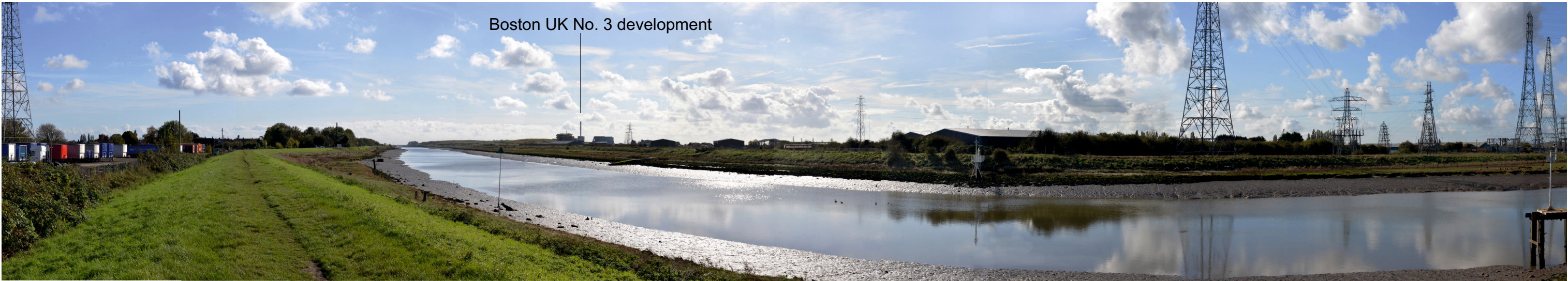
View 8: Looking south from Footpath Bost/13/3 near St Nicholas’s Church, Skirbeck Conservation Area and properties off The Featherworks / Skirbeck Gardens (E533779, N342990, 6mAOD, 169 degrees, 260m from site boundary)